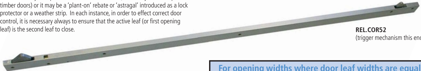
REL.COR52 (trigger mechanism this end)

The rebate may be a part of the door construction (commonly found on pairs of timber doors) or it may be a 'plant-on' rebate or 'astragal' introduced as a lock protector or a weather strip. In each instance, in order to effect correct door control, it is necessary always to ensure that the active leaf (or first opening leaf) is the second leaf to close.